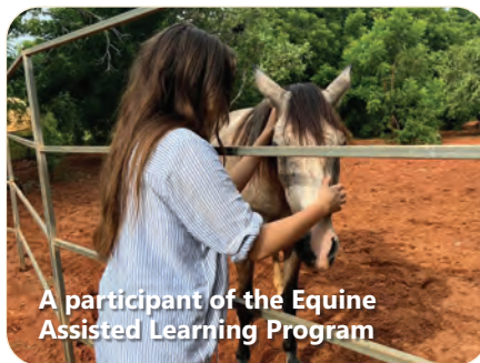
A participant of the Equine Assisted Learning Program

*Name & image changed to protect privacy