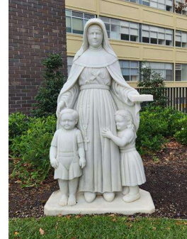
Mary MacKillop Place, North Sydney

One of the most inspiring things about Saints is that they are people who lived in the world just like us. As we can see with Mary's life, Saints dedicated every day to honouring God and sharing His love by serving others.