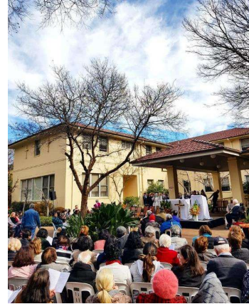
Feast Day 2018, Mary MacKillop Place, North Sydney

All Saints have dedicated Feast Days when they are remembered with special mention and prayers. Mary MacKillop's Feast Day is on 8th August, which is the day she died.